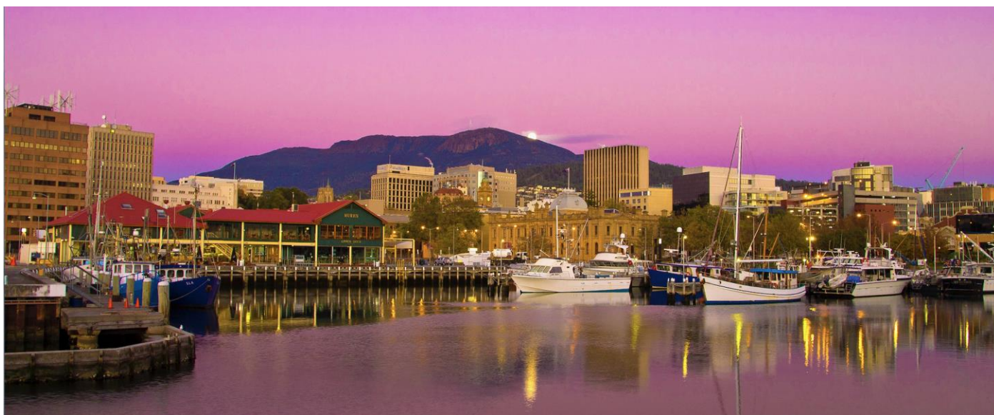
Hobart Waterfront

MyState Bank Arena, Brooker Hwy, Glenorchy