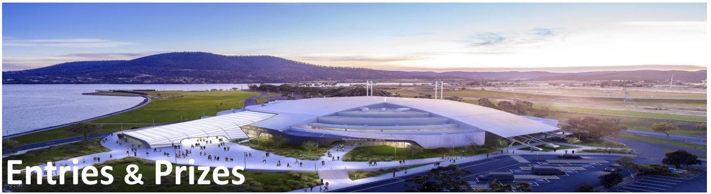
My State Bank Arena